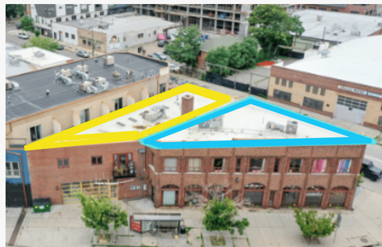
CURTIS IN YELLOW, BROADWAY IN BLUE